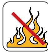
Flame Retardancy NF C32-070-2.1(C2) IEC60332-1-2/EN50265-2-1