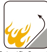
Reduced Fire Propagation NF C32-070-2.2(C1) IEC60332-3-24/EN50266-2-4