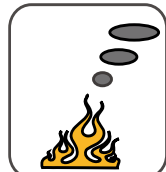
Low Smoke Emission IEC 61034-1&2 EN 50268-1&2/NF C32-073