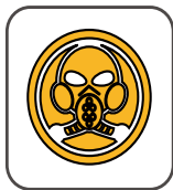
Low Toxicity NES 02-713/NF C 20-454