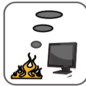
Low Corrosivity IEC60754-2 EN50267-2-2/3 NF C 32-074