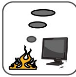
Low Corrosivity IEC60754-2 EN50267-2-2/3 NF C 32-074