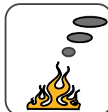
Low Smoke Emission IEC 61034-1&2 EN 50268-1&2/NF C32-073