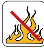
Flame Retardancy NF C32-070-2.1(C2) IEC60332-1-2/EN50265-2-1