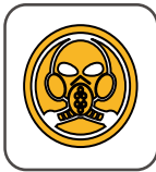
Low Toxicity NES 02-713/NF C 20-454