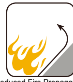
Reduced Fire Propagation NF C32-070-2.2(C1) IEC60332-3-24 EN50266-2-4