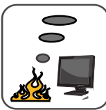
Low Corrosivity IEC60754-2 EN50267-2-2/3 NF C 32-074