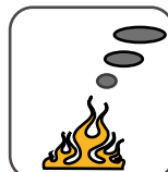
Low Smoke Emission IEC 61034-1&2 EN 50268-1&2/NF C32-073