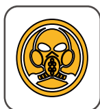
Low Toxicity NES 02-713/NF C 20-454