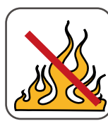
Flame Retardancy NF C32-070-2.1(C2) IEC60332-1-2/EN50265-2-1