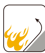
Reduced Fire Propagation NF C32-070-2.2(C1) IEC60332-3-24 EN50266-2-4